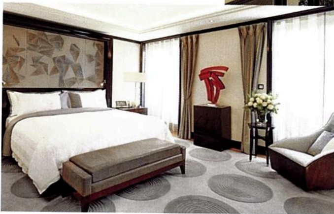
Clockwise from top: view of the Eiffel Tower from The Peninsula Paris; The American Bar, The Savoy, London; Katara Suite at The Peninsula Paris